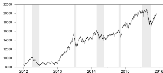
Figure 2 Hong Kong Stock Market Situation