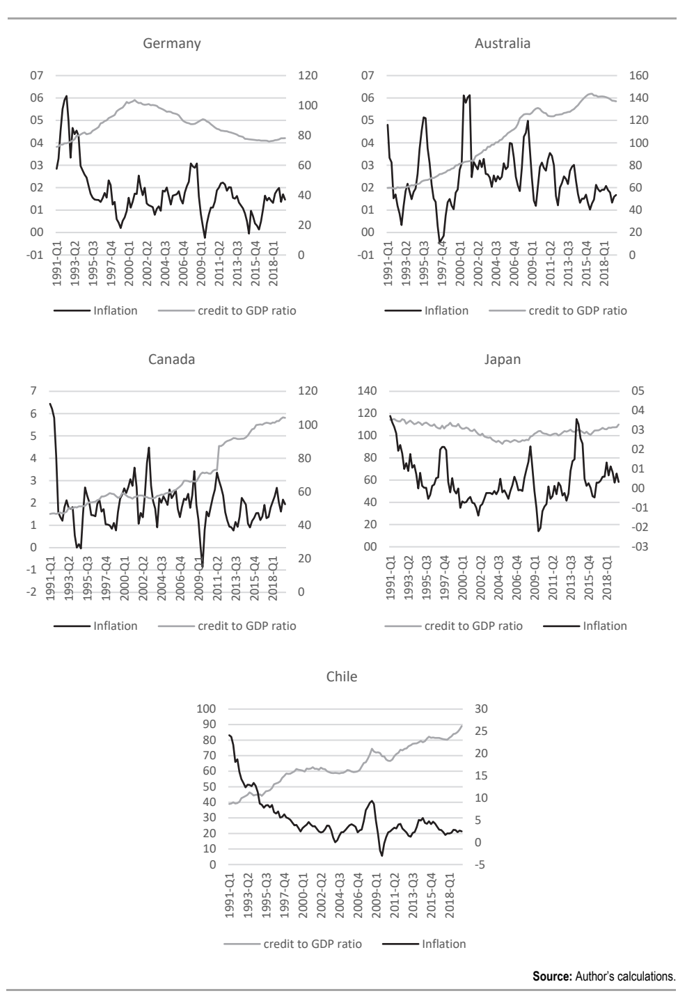
Figure A5 The Credit-to-GDP Ratio and Inflation for Developed Countries