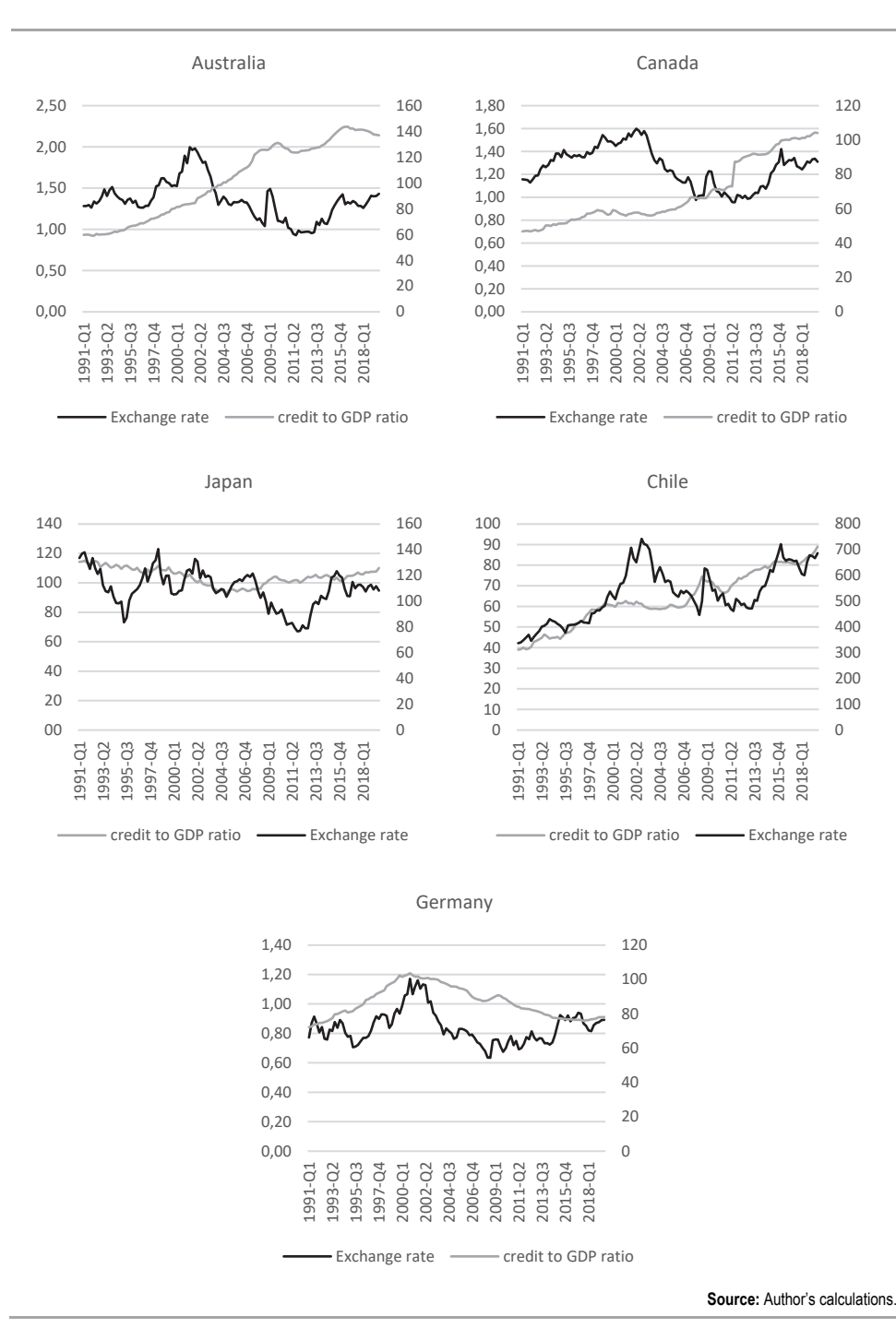
Figure A3 The Credit-to-GDP Ratio and Exchange Rate for Developed Countries