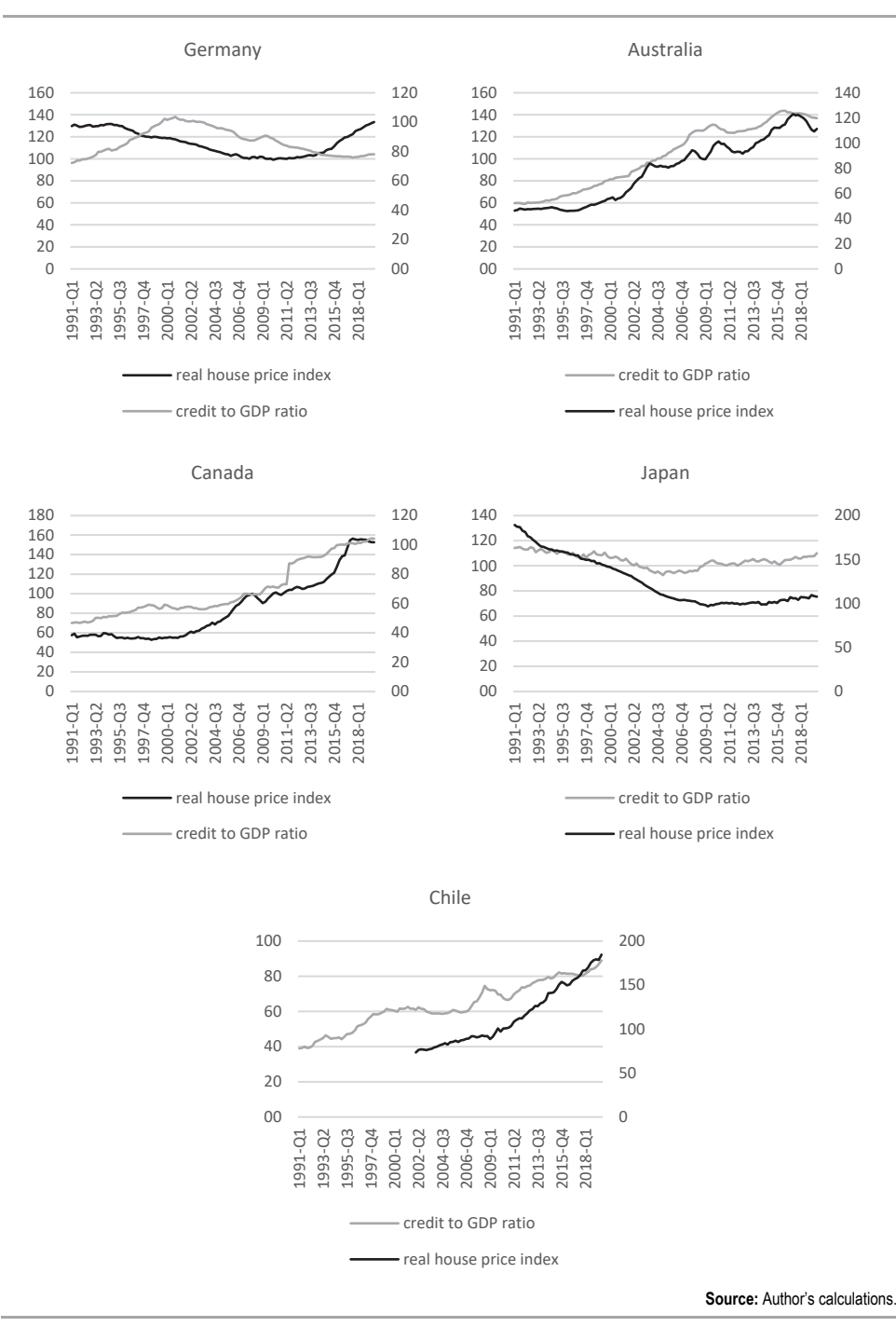
Figure A1 The Credit-to-GDP Ratio and House Prices in Real Terms for Developed Countries