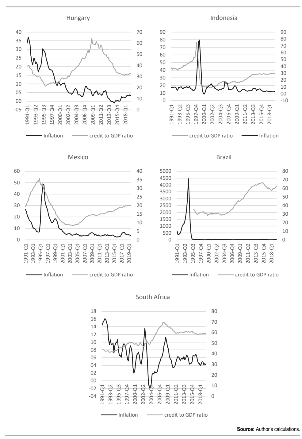
Figure A6 The Credit-to-GDP Ratio and Inflation for Emerging Market Economies