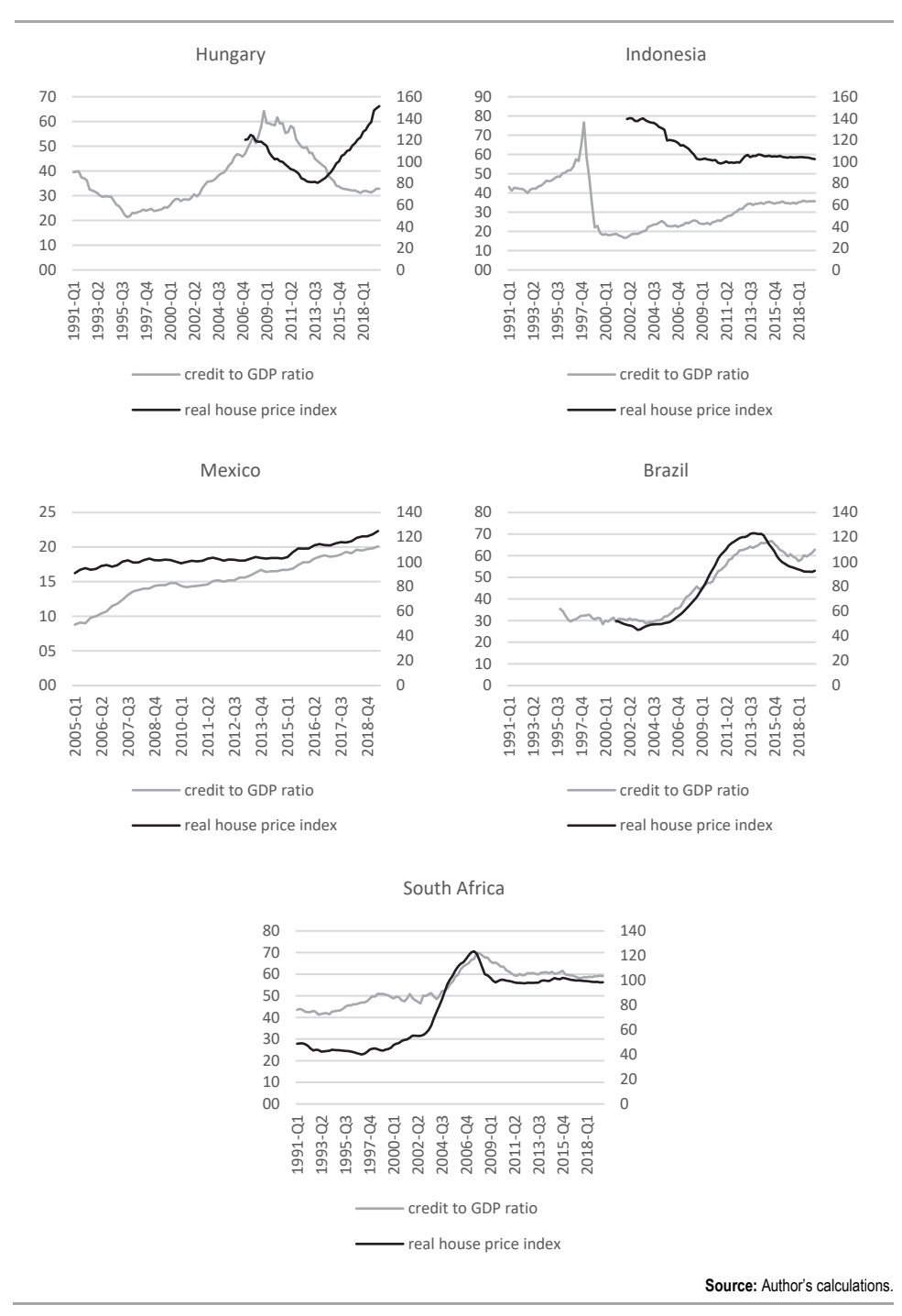
Figure A2 The Credit-to-GDP Ratio and House Prices in Real Terms for Emerging Market Economies