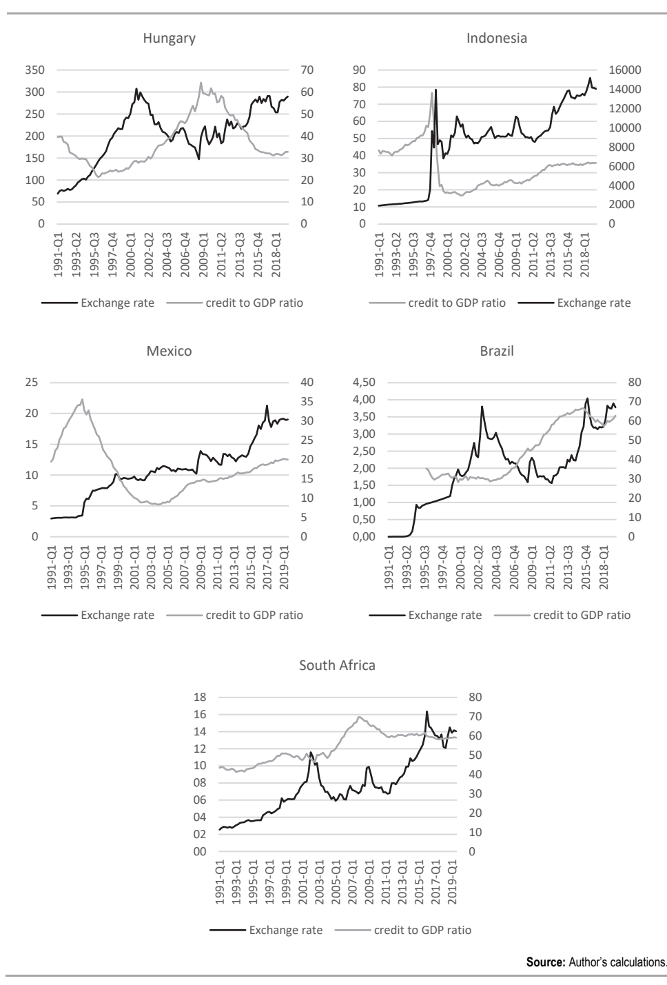
Figure A4 The Credit-to-GDP Ratio and Exchange Rate for Emerging Market Economies